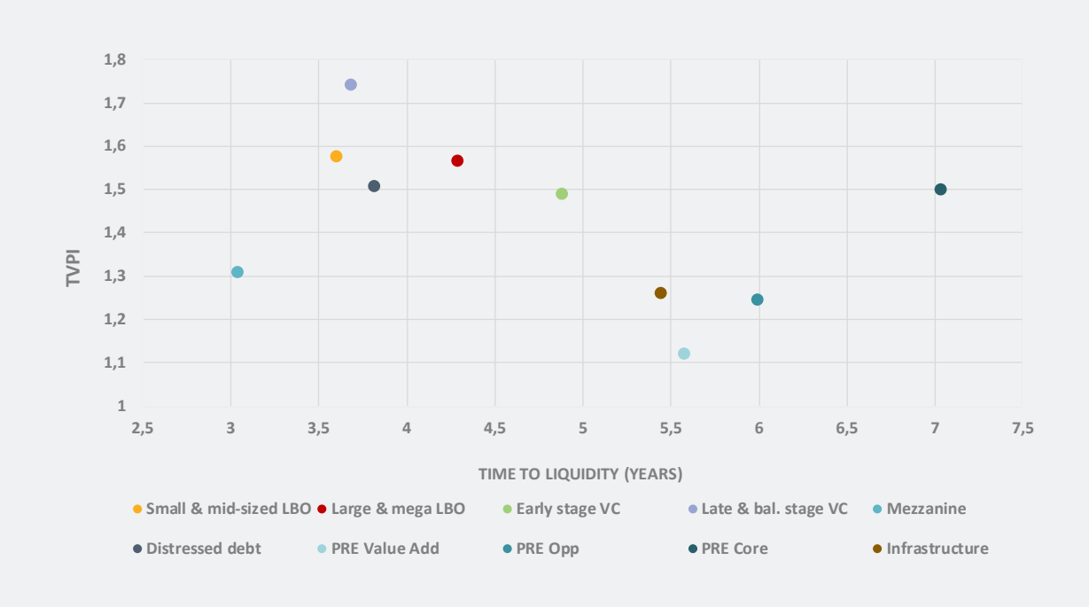
Figure 1 – Multiple of invested capital and time-to-liquidity of private markets funds

This means that according to the time-to-liquidity formula, their exposure appears shorter. Although this is coherent with the accounting rules, the reality differs. This is why the time-toliquidity metric should be used when funds are fully or largely realized. The resulting IRRs are much more reliable and accordingly, so is the time-to-liquidity measurement.